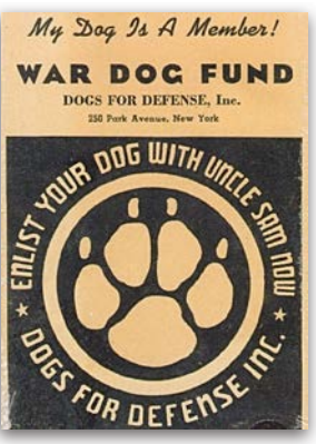
A window sticker to be placed on a donor's car or house window.

In 1942, the U.S. Army received 200 trained sentry dogs from Dogs for Defense. This was the first time in U.S. history war dogs were officially recognized. Their usefulness was quickly realized and by December, the Army, Marine Corps, and Coast Guard requested 125,000 dogs! Dogs for Defense turned to Americans to help fulfill this request. America's volunteer spirit showed itself and approximately 40,000 pet dogs were signed up to join the military. The dogs being volunteered, however, were untrained pets, not working dogs.