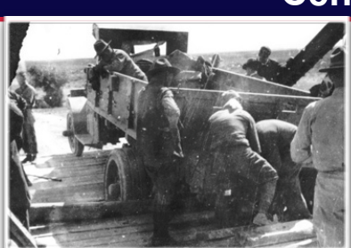
Men struggle to push a truck over a broken bridge deck.