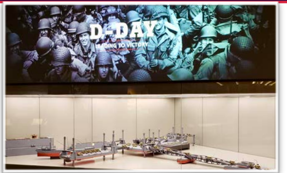
Above, the Mulberry Harbor model is displayed beneath the new D-Day Theater in the Eisenhower Presidential Museum.