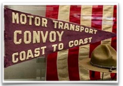
A 1919 Motor Convoy pennant and Ike's Tank Corps campaign hat.

The convoy was deemed a success overall, providing valuable information about the performance of various types of vehicles, tires and repair equipment. Public relations for the Army was stellar as the convoy was witnessed by more than 3 million people and resulted in several hundred Army recruits. The nation benefitted as well. In At Ease , Ike wrote, "The old convoy had started me thinking about good, two-lane highways, but Germany (World War II) had made me see the wisdom of broader ribbons across the land." Visit our new museum exhibits to learn more about how Ike's adventure on the 1919 Motor Convoy led to our modern interstate highway system.