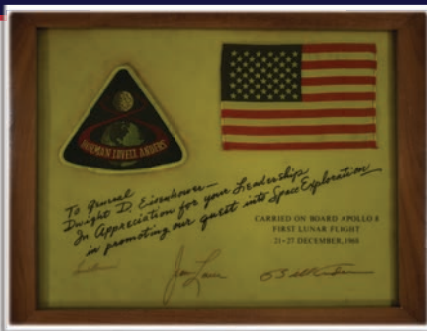
The inscription, signed by the Apollo 8 astronauts, reads, "To General Dwight D. Eisenhower - In appreciation for your leadership in promoting our quest into space exploration."