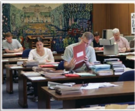
Eisenhower Foundation Travel Grants help researchers fund visits to the Eisenhower Presidential Library.

The 2018 travel grant applicants hailed from the United Kingdom, Spain, Kuwait, Greece, Turkey, Brazil, and Italy, as well as several locations in the United States. Applicants for the Abilene Travel Grant Program apply by mail or through the Foundation website. A selection panel reviews the applications and awards the grants on a competitive basis. If the grantee's research results in a thesis, dissertation, book, or article, a copy of the final product is submitted to the Eisenhower Foundation, then placed in the Library's holdings.