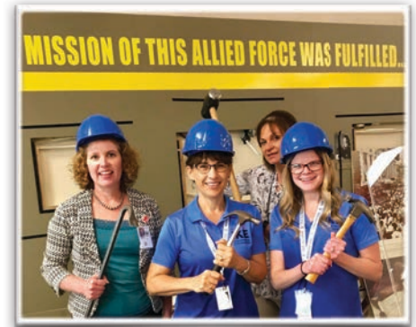
The Eisenhower Foundation staff grabbed hammers and hardhats to officially start the renovation project.