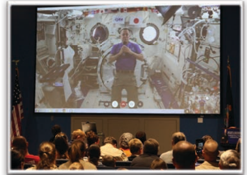
Area Scouts, leaders and families enjoyed a long-distance video call via Skype with Astronaut Ricky Arnold on the International Space Station.

Programs like this support President Eisenhower's legacy of youth education and citizenship training. The Eisenhower Foundation and Presidential Library are pleased to develop partnerships that show Eisenhower's relevance today while reaching a new generation.