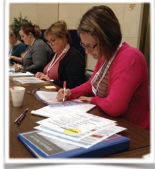
Teacher workshop participants at work in the Library Courtyard.

What happens when 15 dedicated and enthusiastic teachers have access to the primary sources of the Eisenhower Presidential Library, Museum, and Boyhood Home? Creative sparks fly and innovative lesson plans are forged!