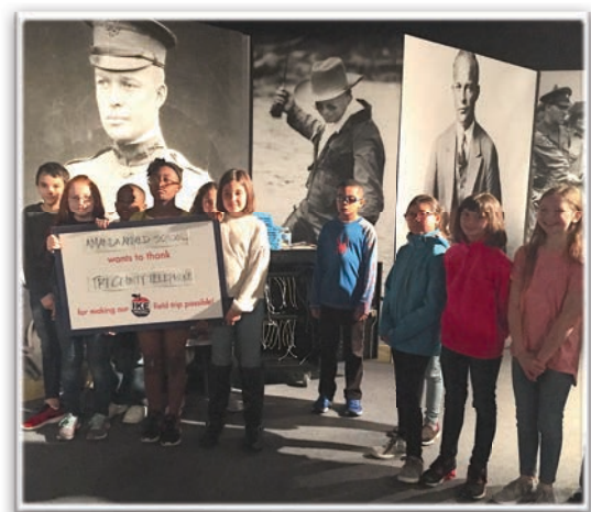
Students from Amanda Arnold School show their appreciation for TCT's donation of 25 iPads used on their IKEducation Field Trip at the Eisenhower Presidential Library and Museum.